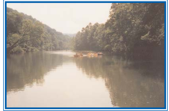
Tourists visit Salem to float the rivers and enjoy the beautiful scenery.

Located in the heart of the Ozarks in south central Missouri, Salem has a population of 4,854. Once dependent on agriculture and land but now dominated by jobs in the service area, this rural community is focused on its long-range planning efforts. Community leaders involve local citizens in the strategic planning process and seek to achieve a balance in economic and community development. These planning efforts are making a remarkable difference in the development of the community in and around Salem.