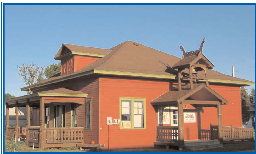
The Milan Village Arts School promotes creativity and expression while preserving the Scandinavian culture for future generations.

For more information about the city of Milan, visit their website at http://milan.govoffice.com/ .